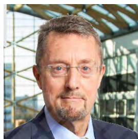
Mr. Bernard Bajolet (Member) (French, 1949)